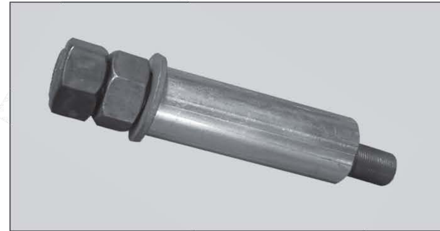
42919 Rear shock removal and installation tool