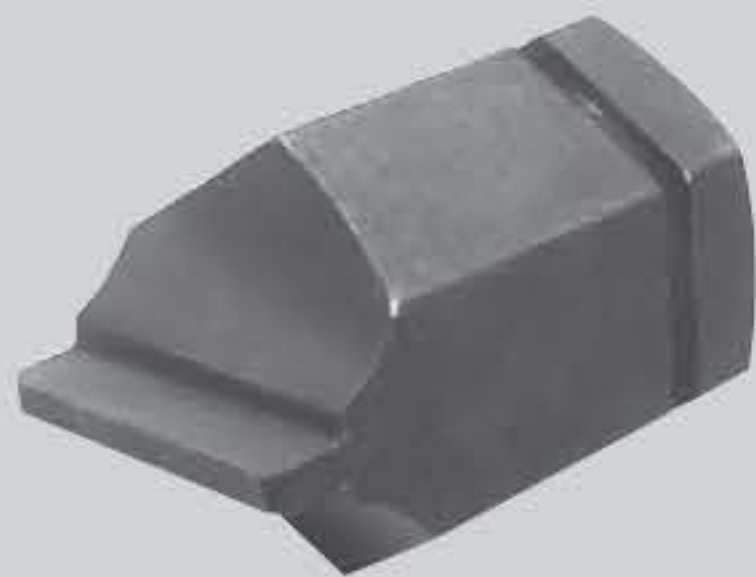
661003-T Inspection plug tool

Rebuilding service: We also offer rebuilding services for rebuilding your primary drive in our service dept.